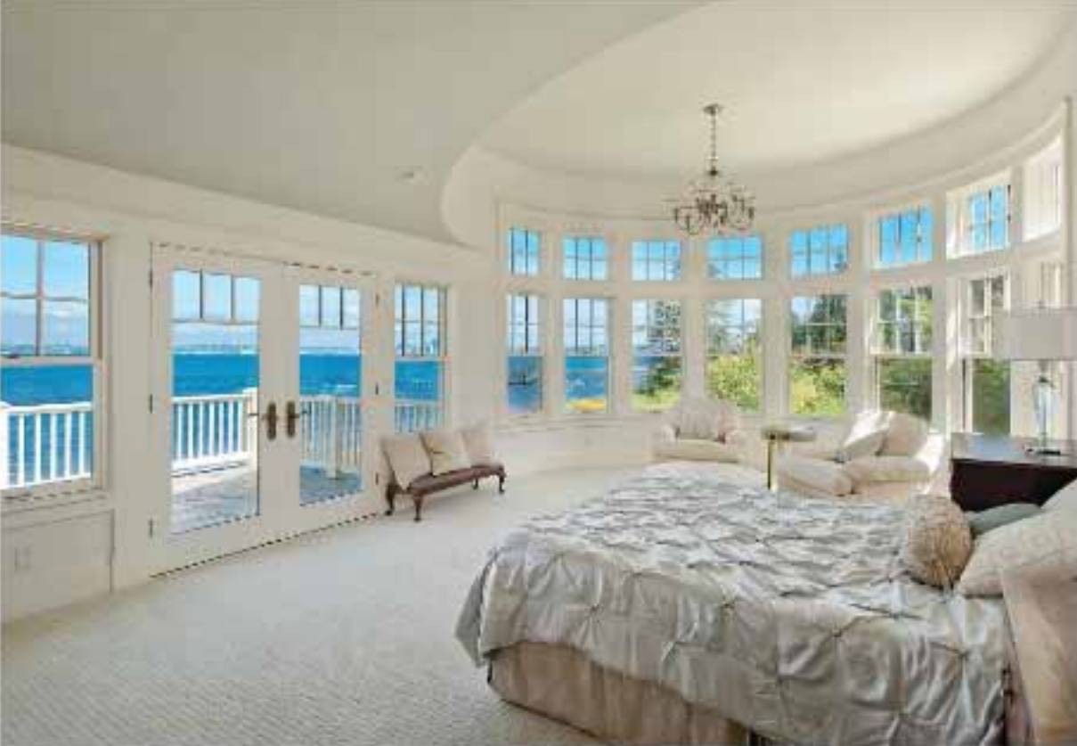
SUITE OF DREAMS Closing your eyes would mean missing the view in this master bedroom wrapped in windows. Of course, you can always settle in with a furry friend and daydream, dawdle or divine inspiration for your next book.

After over a year of writing, she still kept her memoir secret, telling only one trusted friend who read the manuscript while recovering from breast cancer surgery and then encouraged Florio to publish the book to help others going through difficult times. After much considering and re-writing, Florio agreed, and "Heaven's Child" was published in 2012. A soft-spoken, naturally private woman, Florio felt exposed by her own candor in the book and even avoided shopping for groceries at Town and Country Market immediately following publication. But the outpouring of gratitude from readers experiencing similar sorrows has fueled Florio to promote her book and speak publicly on the topic of love and loss.